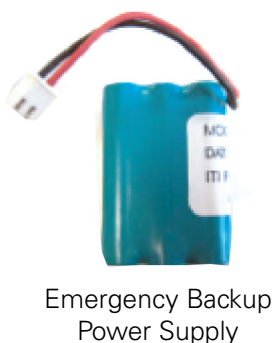
Emergency Backup Power Supply