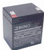
12V 4A Backup Power Supply