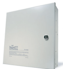
Main Control Panel