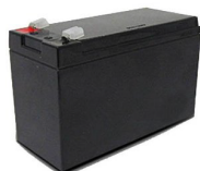
12V 7A Backup Power Supply