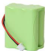
Emergency backup power supply

Take your old emergency backup power supply to the nearest recycling centre.